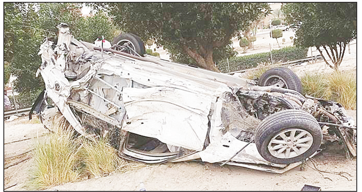
The completely damaged car lying on its top.

He pointed out his client has always believed in the justice system and he was keen to attend all investigation sessions at the Public Prosecution to refute the false accusations leveled against him. In fact, he challenged the other party to provide substantial evi-